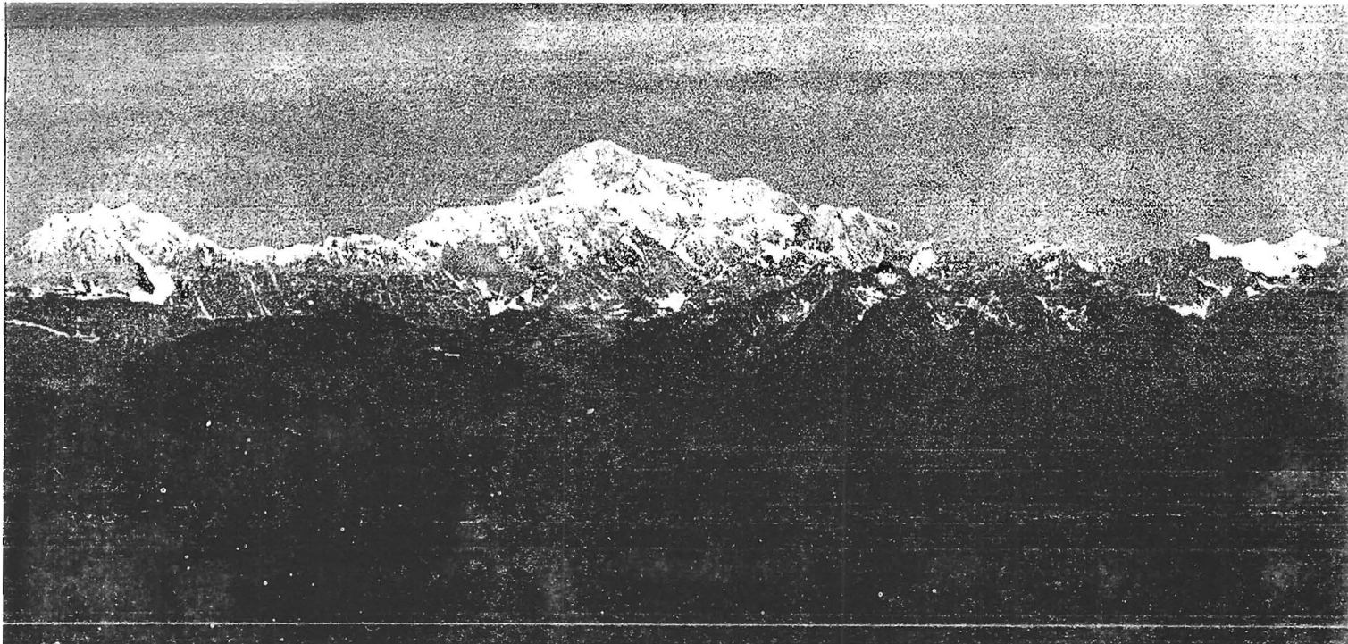
The lead HART crew approaches Mount McKinley, where two Spanish climbers were rescued by the HART crews from Company B, 4th Battalion, 123 Aviation.